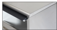
Disappearing insulated door