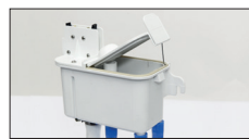
Dust-proof water basin